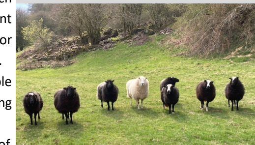
They were like sheep without a shepherd