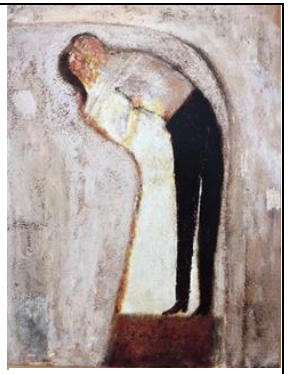
Figure 3. Lovers Entwined, Michael Rees.