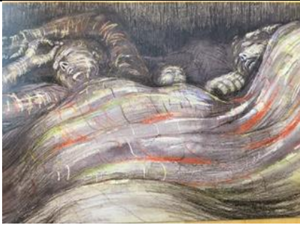
Figure 2. Sleeping: Two Women and a Child, Henry Moore, 1940.