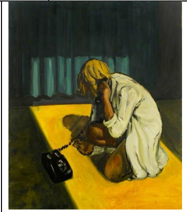
Figure 5. 2 am, Colin Smith 1984