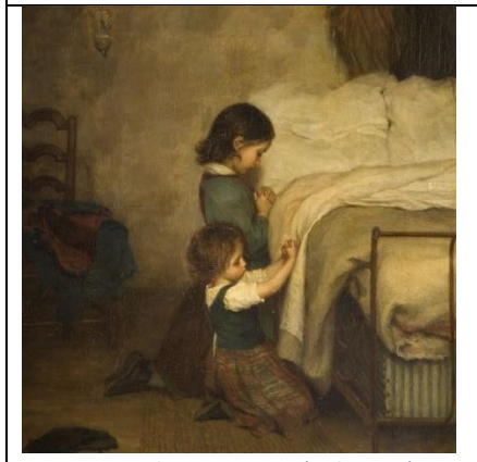
Figure 4. Bedtime Prayers (unknown)